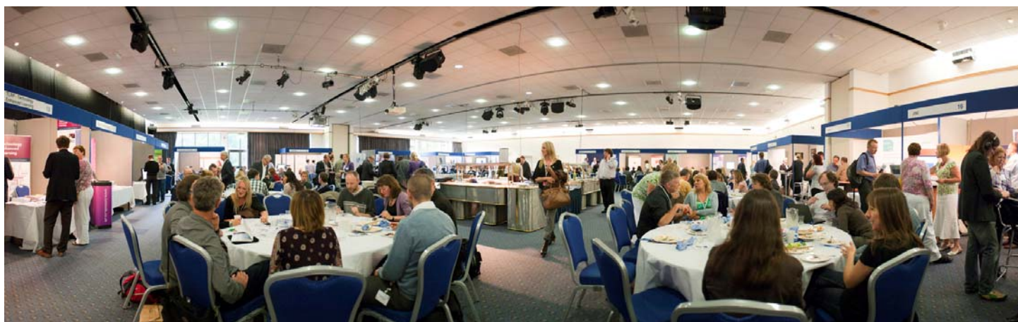
Delegates at lunch during ALT-C 2010 in Nottingham.

Adobe, Anystream, Banxia, Becta, Blackboard Collaborate, Blackboard Learn, British Council, British Library, Channel Content, Desire2Learn, Eduserv, Edutxt, Elluminate, Emerald Publishing, Fronter, Harvest Road, How To Moodle Ltd, Huddle, IMC, Intrallect, Intute, JANET, JISC, JISC Advance, JISC Plagiarism Advisory Service, Jorum, Learning Objects Inc, Learnwise, London Metropolitan University, Mimas, MyKnowledgeMap, Open Nottingham, Pearson, PebblePad, Positive Internet, QIA, Questionmark, Qwizdom, Routledge, Scottish Qualifications Authority, Skillsoft (RBS), Smarthinking, Sungard SCT, Talis Education, The Development Manager, The Higher Education Academy, Toshiba, The Tribal Group, Visual Education Ltd, Webducate, Westcliffe, and Ufi/learndirect.