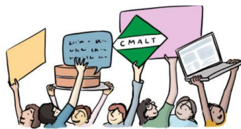
CMALT Accelerator - Agenda