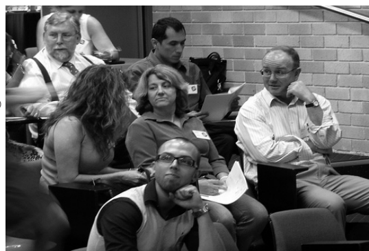
LAMS and Learning Design Conference