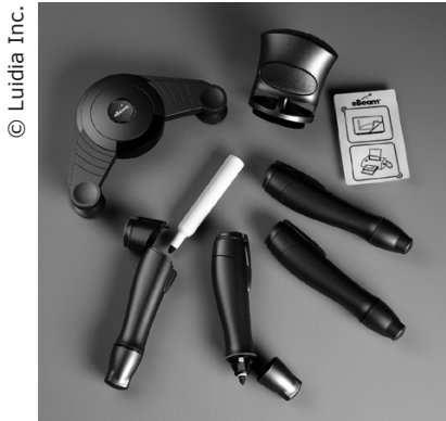
The eBeam interactive whiteboard and capture system

The eBeam is a device which can convert any flat surface into an interactive whiteboard or smartboard. It can also be used to capture content digitally from a normal whiteboard in real time for later review or for publishing online. This article describes the system in more detail.