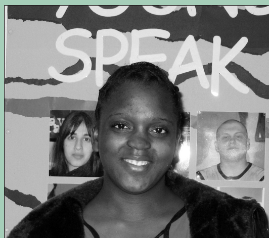
Some of the students involved in the Young People Speak Out and Hip Hop projects at the Sheffield College