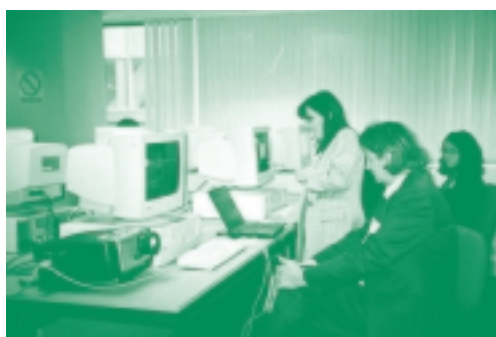
HANDS-ON WORKSHOP AT THE ECONTENT CONFERENCE