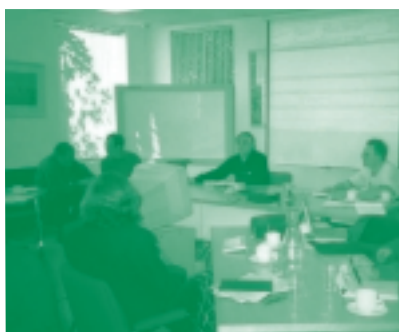
USING THE ZING CONFERENCING SYSTEM DURING THE AUSTRALIA STUDY TRIP

Another successful SURF study trip took place during April which included visits by SURF members to eight UK HE institutions, as well as ALT, the LTSN and the ILT. A return trip to the Netherlands is planned for Spring 2003 and will include a joint ALT/SURF one day conference – 'Making Connections: Connecting People, Connecting Technology'.