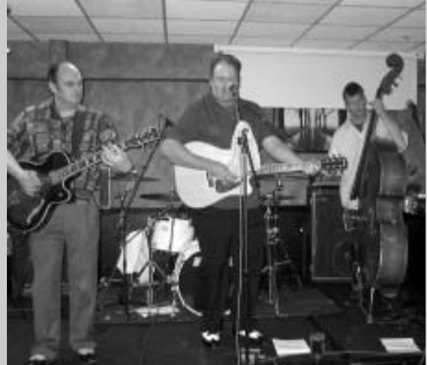
The band, Lazy Dollies, at the Monday evening reception