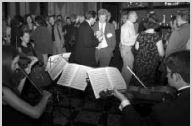
A string quartet sets the tone at the reception in the Cutler’s Hall on Tuesday evening